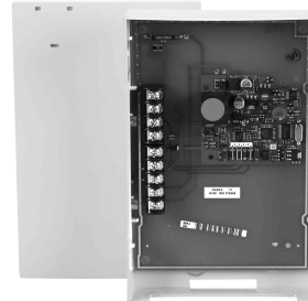
DCID-EXT Dialer Capture Intelligence Device (For Non-ECP capable control panels)